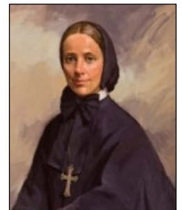
Feast Day: November 13