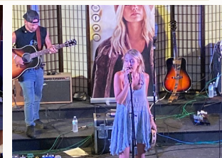
Country star Claudia Hoyser - 2022