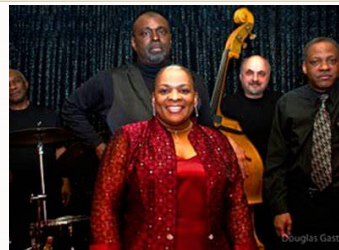
The Jazz Example (above) and pop star Ddendyl (below) 2015