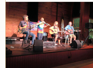
The Old Hippies - 2019