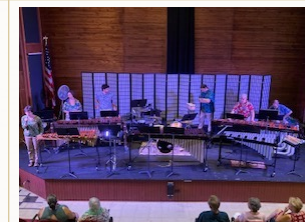
RPO Marimba Band 2022