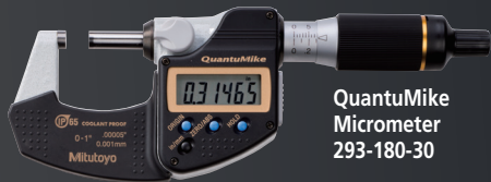
QuantuMike Micrometer 293-180-30