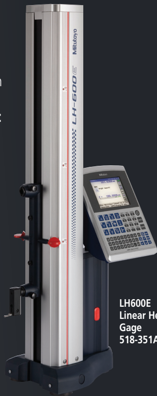
LH600E Linear Height Gage 518-351A-21