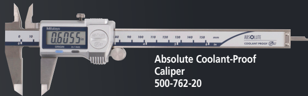
Absolute Coolant-Proof Caliper 500-762-20