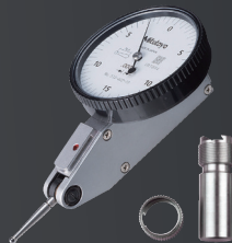
Dial Test Indicator 513-402-10E