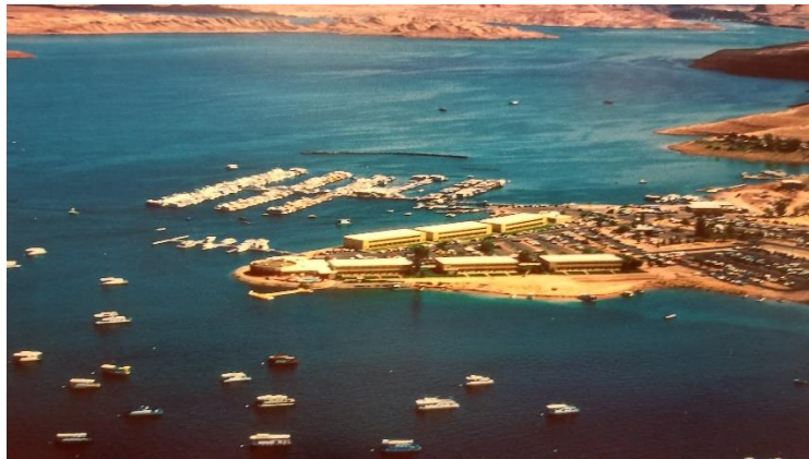
Lake Powell 1980

The RMGA Program for January 9, 2023 will be presented by Steve Kaverman. The program is titled, The Colorado - A River in Peril . We will look back at the Colorado River Compact of 1922, review the status of both major reservoirs and their dams, and consider the future of Colorado River water. The presentation will include a PowerPoint and the meeting will take place via Zoom. Watch your email for the link.