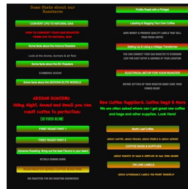
SHOWN ABOVE: SOME OF THE VIDEO CLIPS AND PDF TRAINING ON OUR WEB SITE