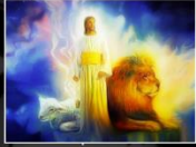
Yeshua ben Joseph and Yeshua ben David.

Astronomically speaking, there are 3 Constellations ruled by Leo that completes this final picture of Prophecy and the Genesis 3:15 issue.