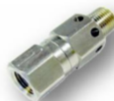
Quick Exhaust 3