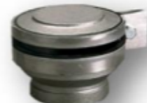
3" Grooved Adjustable Head