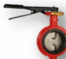
Wafer Butterfly Valve