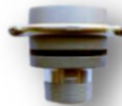
7" Valew Style Head - MIP