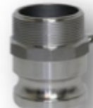
1-1/2" - 4" Male Camlock - F Style