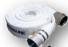
2"-2-1/2" 25' & 50' Hydrant Fill Hose