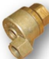
Quick Exhaust 2