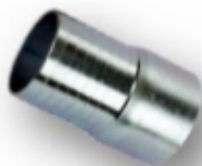
2-1/2" - 4" Weld Hose Nipples