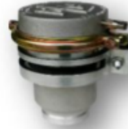
Bertolini Style Spray Head