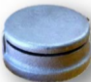
2"-2.5"-3" Slotted Cap