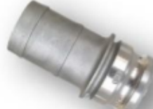
1-1/2" - 4" Camlock - E Style