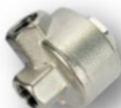
Quick Exhaust 1