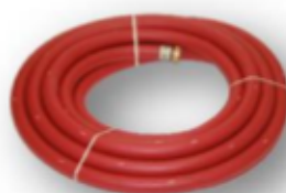
1" -1-1/2" 50' & 100' Water Hose