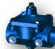
2"-2.5" CI CLA Style Control Valve