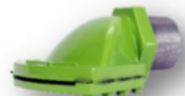
6" x 1/16" 2" Threaded Nozzle