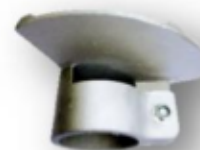
3" Slip Over Deflector Head