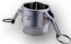
1-1/2" - 4" Female Camlock - D Style