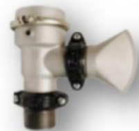
Tee Valve Kit - Flusher