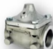
3" Alum. CLA Style Control Valve