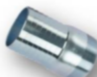
1" - 4" Threaded Hose Nipples