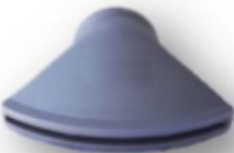
Duckbill 7" x 1/4" Side Spray Head