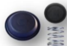
Valve Repair Kits