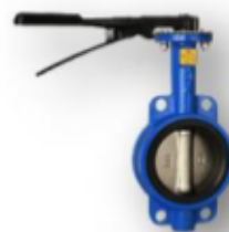
Lug Butterfly Valve