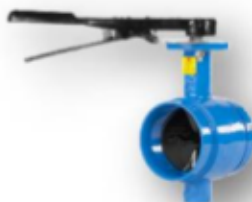
Grooved Butterfly Valve