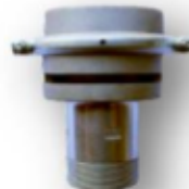
8-3/4" Valew Style Head - MIP