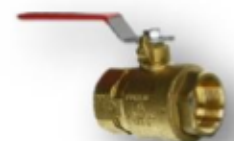
Threaded Ball Valves