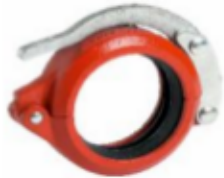
Hinged 2" - 4" Grooved Couplings