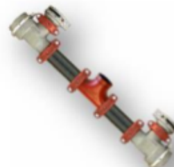
Fabricated Spray Bars