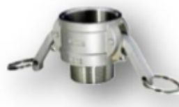
1-1/2" - 4" Male Camlock - B Style