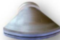
7" x 3/32" Flusher Spray Head