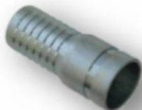
2-1/2" - 4" Grooved x Hose Barb