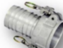
1-1/2" - 4" Camlock - C Style