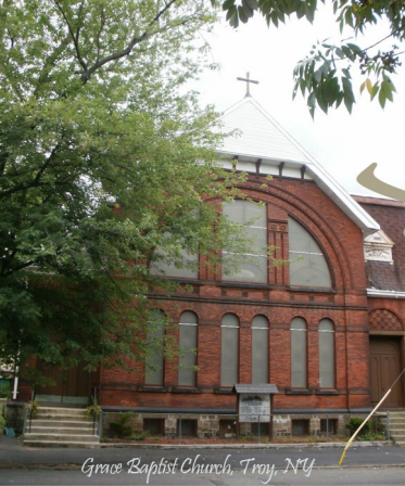
Grace Baptist Church, Troy, NY