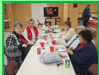
The ladies after enjoying the pizza and cake!