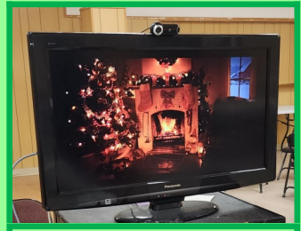
We gathered around the fireplace and listened to Christmas songs.

Triangle Branch Unit 182 Merry Christmas 2023