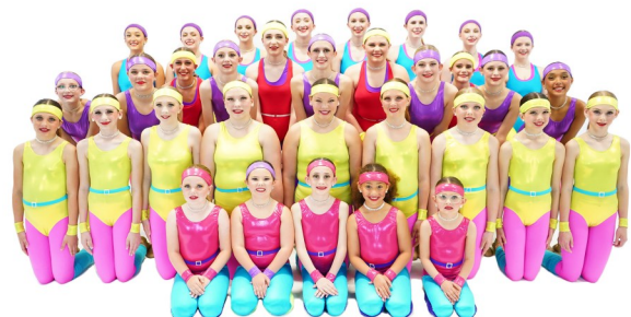
Elite Company 2022-2023

Thank you for considering us! The Staff of Studio 55 Dance