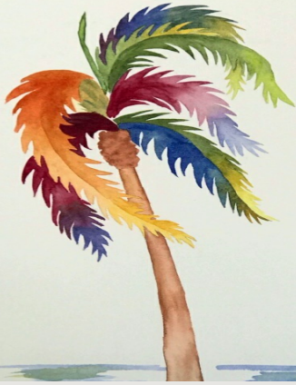
Palm City Art Associates