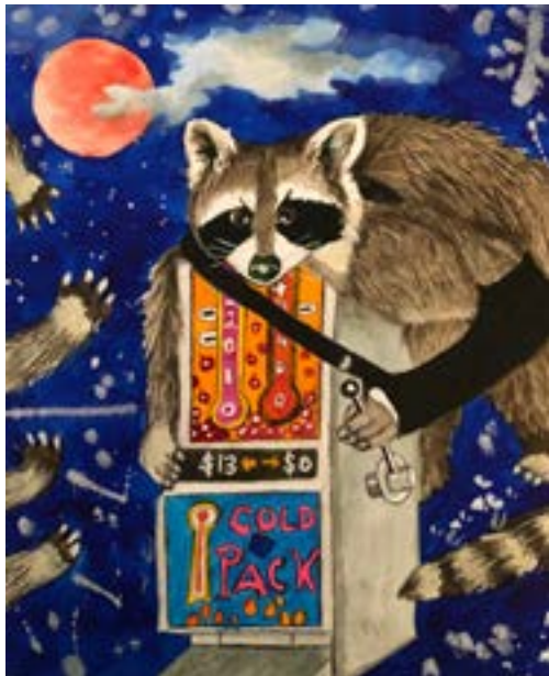
One-Arm Bandit, Mixed media watercolor 14" x 11" 2023 done after I broke my elbow in June