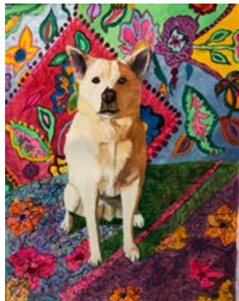
Yuki, Dog portrait, watercolor on paper 11 x 14" 2022 sold to Rodgrigo Chaves