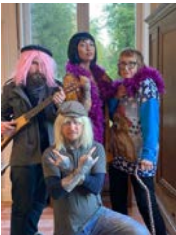
Hamming it up at Orquevaux in 2021, faux rock band