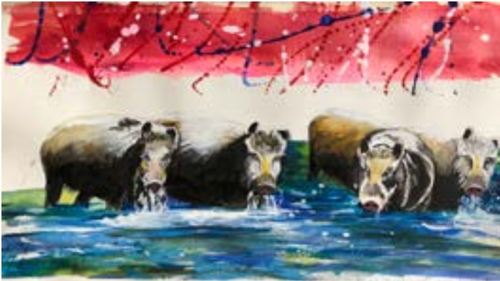
Les Caprices, kept by Orquevaux for their collection, watercolor on paper