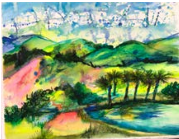
Fantasy Phantom Palms watercolor from stay at Chateaux Orquevaux 2021