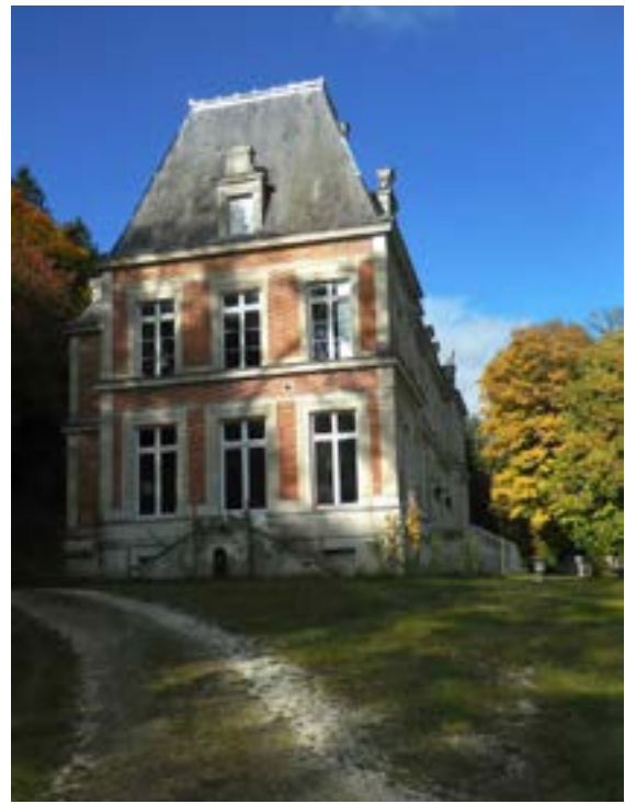
In October of 2021, I attended a residency at Chateaux Orquevaux for a month. Chateaux Orquevaux from my stay there

Me with digital image of my painting Exactly the Same but Completely Different, the Alice Neel show at the DeYoung museum 2022