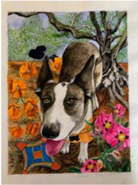
ChuChuck, watercolor dog portrait