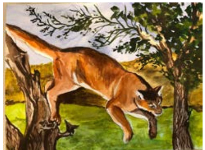
Leaping Puma watercolor sold to the Marmons as a result of Dorland stay