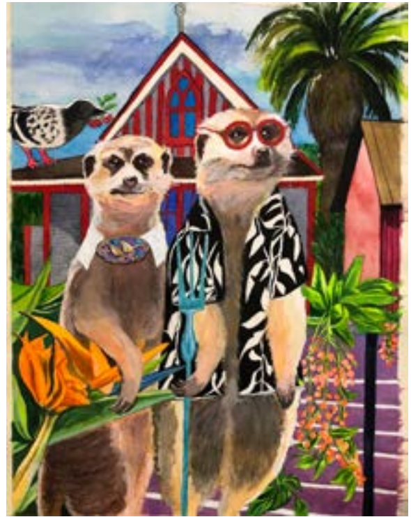
American Gothic Meercats, watercolor

I will have a punk postcard in a show at the Brooklyn Museum in 2024 in a Networks exhibit.