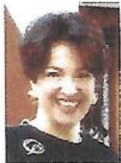
Experience Makes The Difference