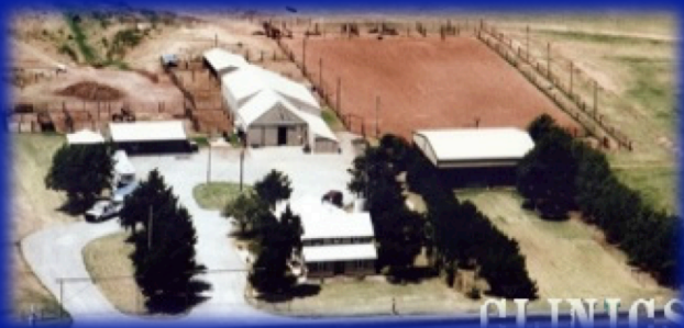
Phil's training facility in Weatherford, OK

In the training business your success depends completely on referral business and return business from existing customers. You can advertise and market all you want but if you don't put out a product that satisfies your customers, they won't be back. The one slogan that I have always used is, "you're only as good as the last set of horses you put out." I remind myself of this every day and every time I am getting ready to send another horse home I ask myself, "have I prepared this horse so that he can reach his potential at some point down the road?" This is what I strive for each day that I have a horse in training. This is a pretty simple question, but sometimes not all that easy to accomplish. The years of experience definitely help when it comes to duplicating this feat with each set of horses that you have in training.