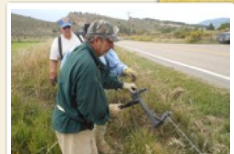
Fencing crew at their best

.....I contacted the Northern Colorado Rod and Gun Club to offer to a Skinner sponsored a series of muzzle loading shoots in 2017. No message or commitment has been received.