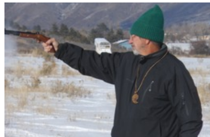
Guests and members shooting