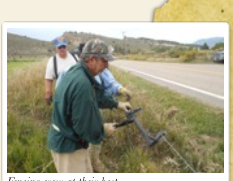
Fencing crew at their best

.....I contacted the Northern Colorado Rod and Gun Club to offer to a Skinner sponsored a series of muzzle loading shoots in 2017. No message or commitment has been received.