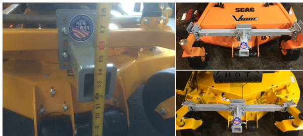
D'ttach Pile Driver Leaf Plow