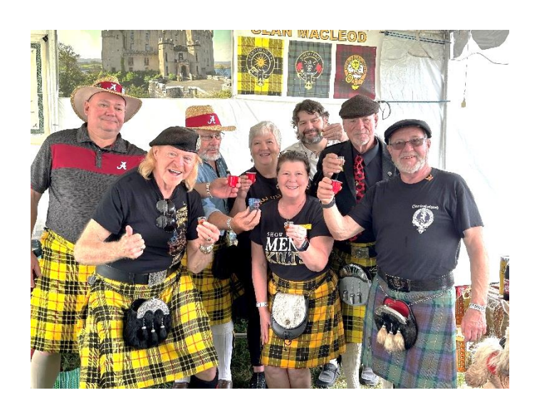
Great Friends and Members at the Clan MacLeod Tent