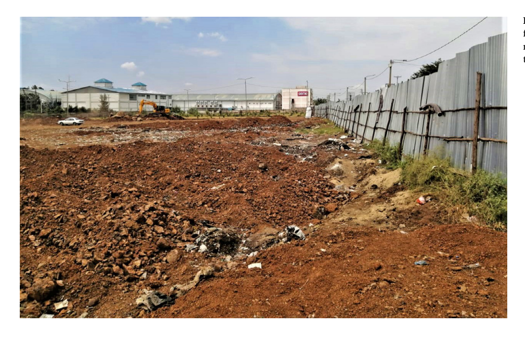
Fig. 1. Kachok dumpsite under rehabilitation: fence to the right, waste removal and soil movement activities, and planting of trees in the distance.