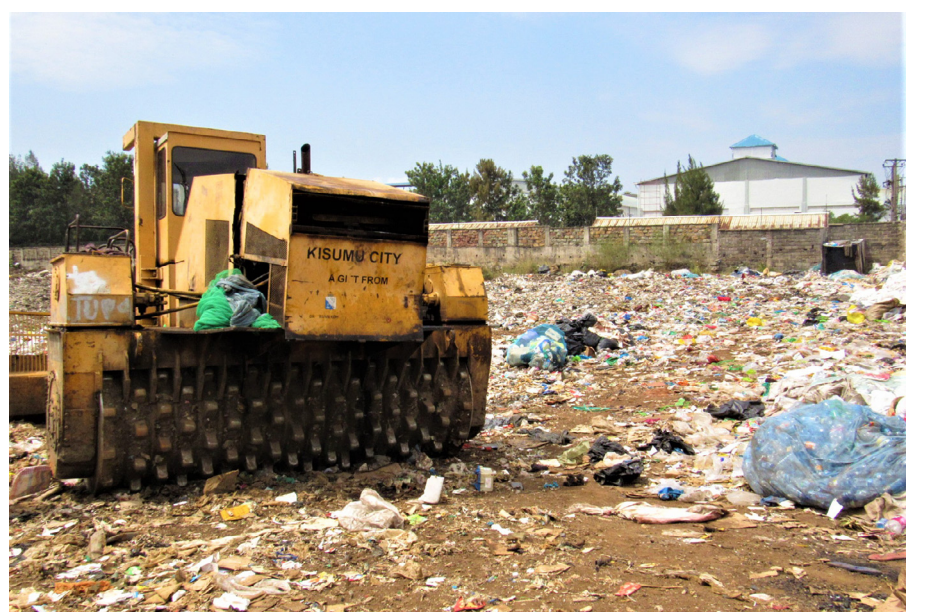
Fig. 2. Back portion of Kachok still housing fresh waste, and a compactor machine.

Fig. 1. Kachok dumpsite under rehabilitation: fence to the right, waste removal and soil movement activities, and planting of trees in the distance.