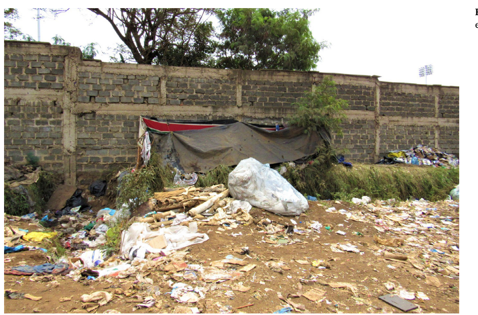
Fig. 4. Extremely precarious shelter where waste pickers were living, inside the dumpsite.

Fig. 3. Waste being disposed in Kachok by a collection vehicle, and waste pickers awaiting to sort out recyclables and other valuable materials.