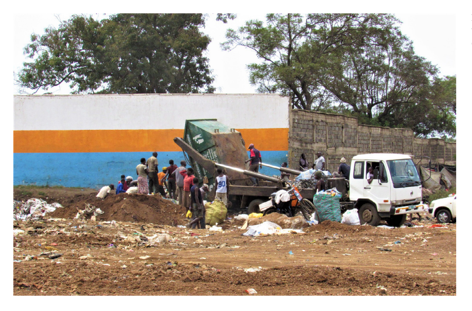
L. Capuano Mascarenhas, B. Ness, M. Oloko et al.

Fig. 3. Waste being disposed in Kachok by a collection vehicle, and waste pickers awaiting to sort out recyclables and other valuable materials.