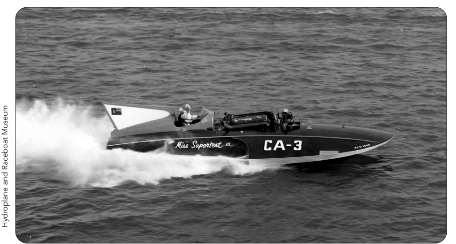
The CA-3 Miss Supertest III in 1959.