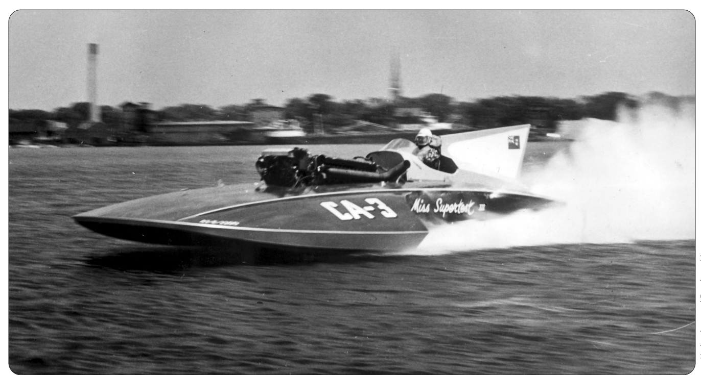
Hydroplane and Raceboat Museum

Oh, the Three was in excellent shape. The Two was certainly starting to show a bit of age, but still in good shape. But, other than the first