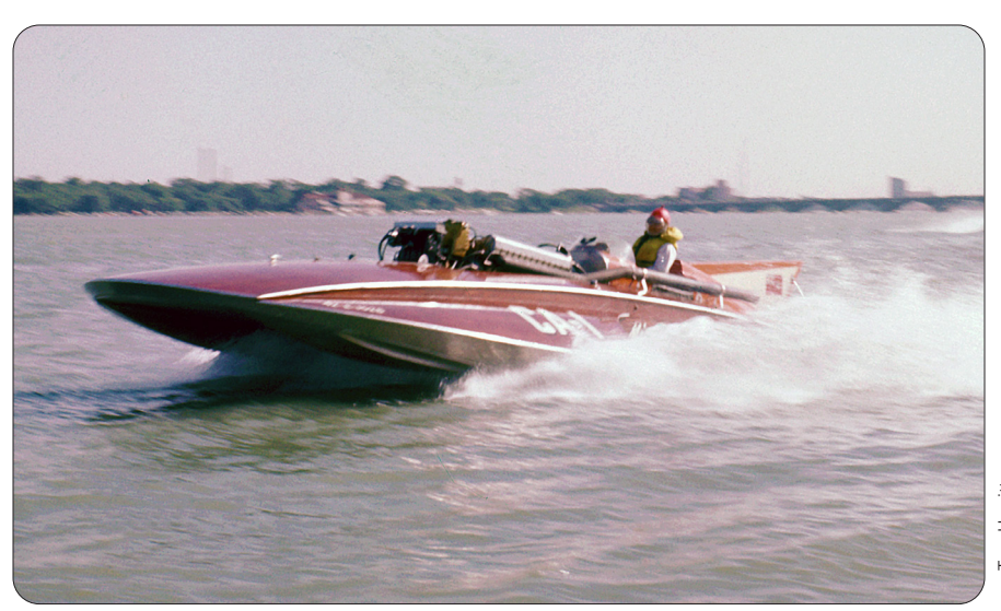
The CA-1 Miss Supertest II in Detroit in 1960.