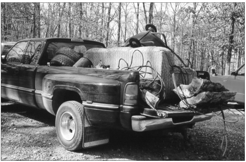
Dan Crane and crew picked up this truckload along Red Bridge Road.

Anyway, Bart volunteered to be tour guide, and Lesa and