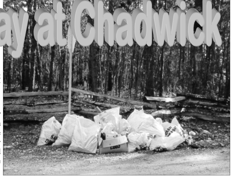
Here is one of the large piles of trash picked up by the Ozark Mountain Trail Riders.

After the trail ride, it was time for food and giveaways. A special thanks goes to Aggie St. Clair for gathering all the food and cooking the chili.