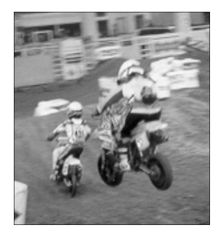
Between the 125 and 250, the 50s race. The racers are between 6 and 8 years old, boys and girls. Here's one of the little girls getting air. That's a teddy bear zip tied to the back of her body armor.