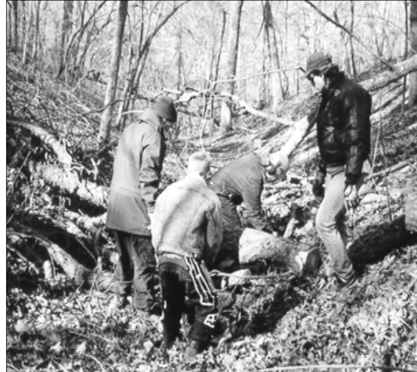
Here are some members of the Ozark Mountain Trail Riders clearing a downed tree on trail 126 E.

Then everyone went riding. Two short loops were set up and the temperatures were warming up into the low forties and sunny.