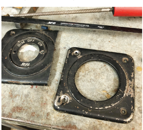
Mount made from half of a 1919-25 switch plate

Your Tech Editor installed this meter on three different Model T's because of its unique feature of running off the magneto. The first installation was simple, as my 1927 Touring already had a hole in the dash where a defunct water temperature gauge had been installed. Wiring was simple, with a lead to the mag terminal and ground wire to a mounting screw for the meter.