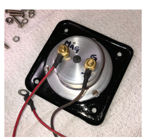
Back side of speedometer/tachometer showing wiring terminals

When I installed a second meter on my 1925 Touring, I used the ammeter side of a spare Ford switch plate. After sectioning the panel and trimming one side, I hammered it to make the rounded edges. I fastened the meter to the shortened panel with the same small screws that mount the normal large-size Ford ammeter. I crafted the necessary wires with soldered and insulated terminals. Next, I drilled a two-inch hole in the dash to the left of the steering column and mounted the meter with screws similar to those used with the ignition switch plate. This location affords a good view of the speedometer-tachometer from the driver's seat.