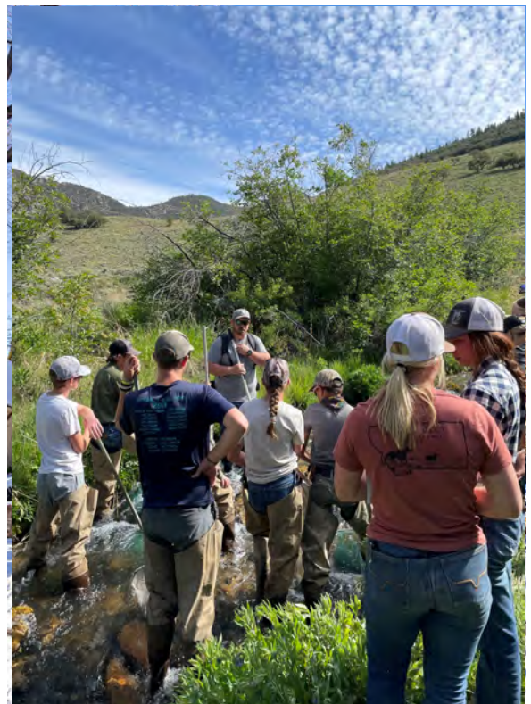
Range Camp Students from 2024 listen to a stream side briefing