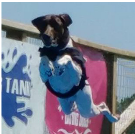
Braggs from the De Roo Zoo

This last weekend (July 15-16) I showed Regatta Rose CDX TD RA RATCH, aka Bett, at the Oshkosh Kennel Club show in Rally Excellent class. Saturday she qualified with a score of 99 and second place for her first leg. Then on Sunday she earned her second leg with a perfect score of 100 and again second place in the class. Another dog was faster than Bett.