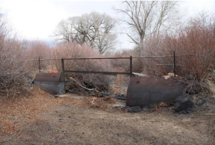
Diversion dam looking downstream