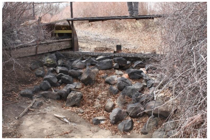
Diversion dam looking upstream