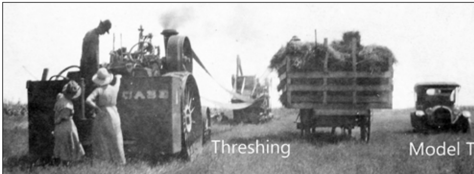
Out of town relatives (city folk) drove out to see the Case threshing machine in action. Note: The women standing by the machine are not dressed for farm work and Model T's were not generally seen at threshing sites.

By Lois Scheetz Bialas and Karen Metzger Pooley, Aug. 2015