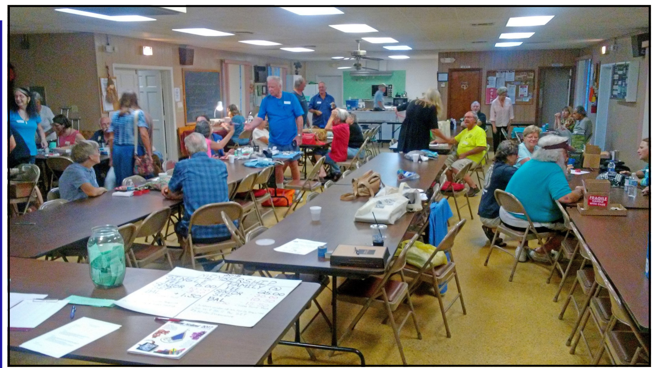
The October monthly club meeting underway.