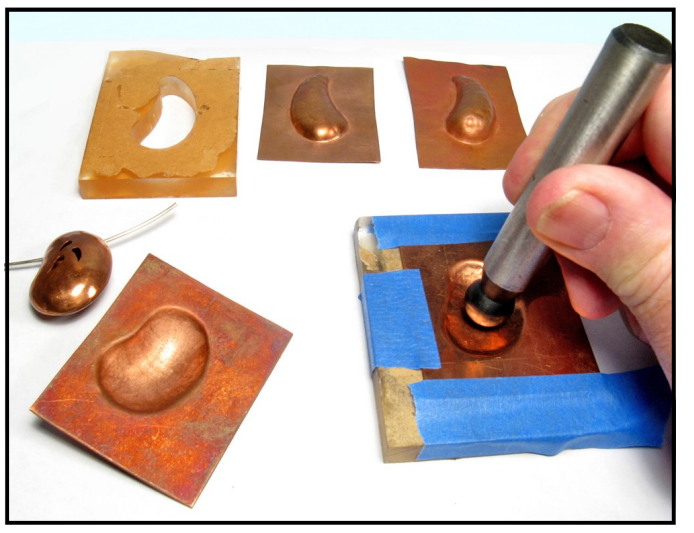
A piece of plastic being used as a forming die.

If you can't find a shop with Google or Yellow Pages, do a search on <u>Ebay.com</u> for scrap plastic by the pound.