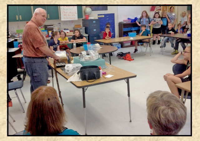
Classroom lecture at Yankeetown School