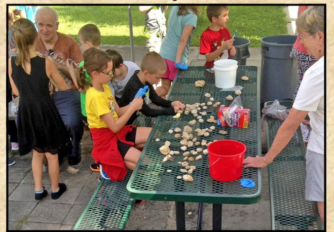
Student cleaning an echinoid