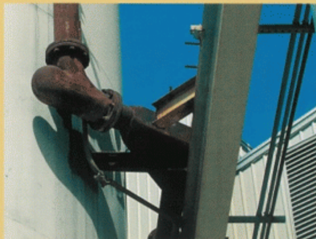
The Smart Elbow's rounded chamber design enables conveyed particles to gather and swirl inside a self-renewing, rotating ball that virtually eliminates wearing impact. Shown is the 6-in. tungsten carbide coated HammerLast 300 model installed in Carbo Ceramics' Eufaula facility.

Sorensen tested a single Smart Elbow, a 6-in. tungsten carbide coated HammerLast 300 model, in June 2000. He quickly began replacing