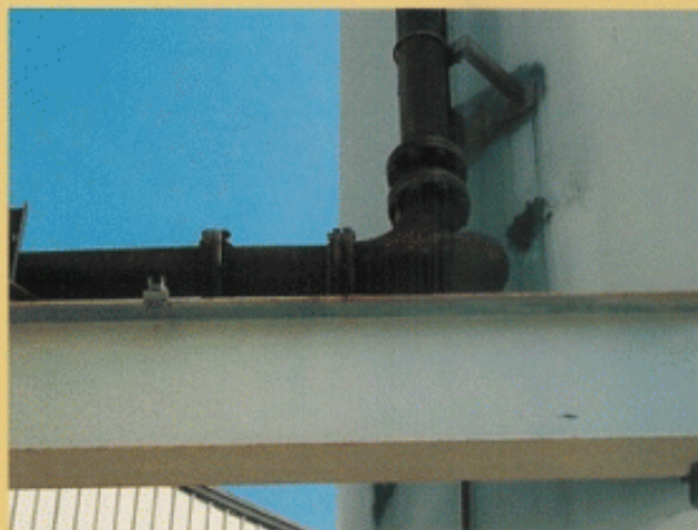
The Smart Elbow was installed in the conveying line in both vertical and horizontal positions. The brown spot to the right of the elbow is a wear spot where the old elbows had failed, leaving the conveyed material to impact the silo wall.