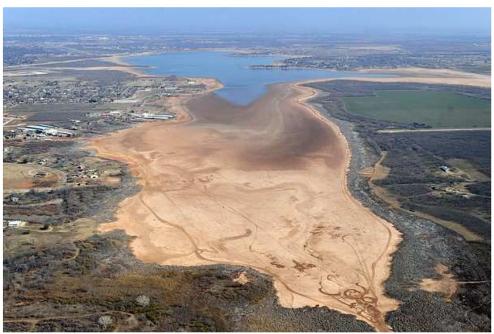
Lake Arrowhead Wichita Falls Texas