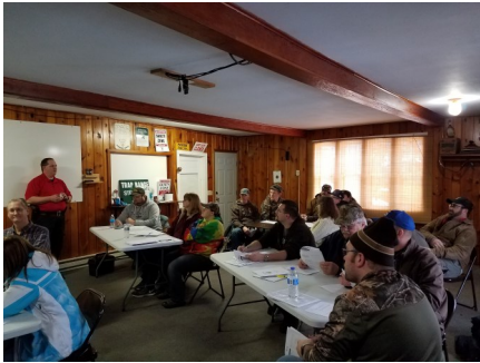
South Dakota Enhanced Permit to Carry Concealed Class At Dell Rapids Sportsmen's Club

Our business was established in 2012, to provide quality firearms training to South Dakotan's. We provide a wide range of courses for students of all skill levels in a variety of shooting disciplines. Our Certified Instructors are retired law enforcement officers who have years of experience teaching law enforcement officers defensive shooting skills for self-defense. Since our opening in April of 2012 Schlueter Firearms Instruction and our instructors have been teaching law abiding citizens defensive shooting skills needed concealed carry for self-defense. Our philosophy is: