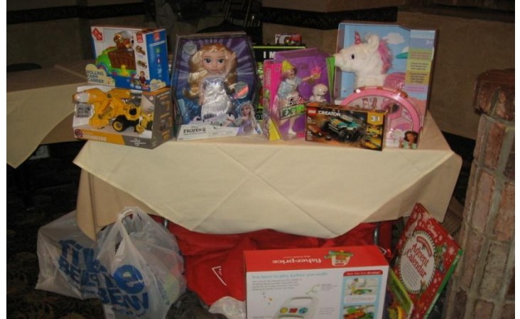
Toys for Tots