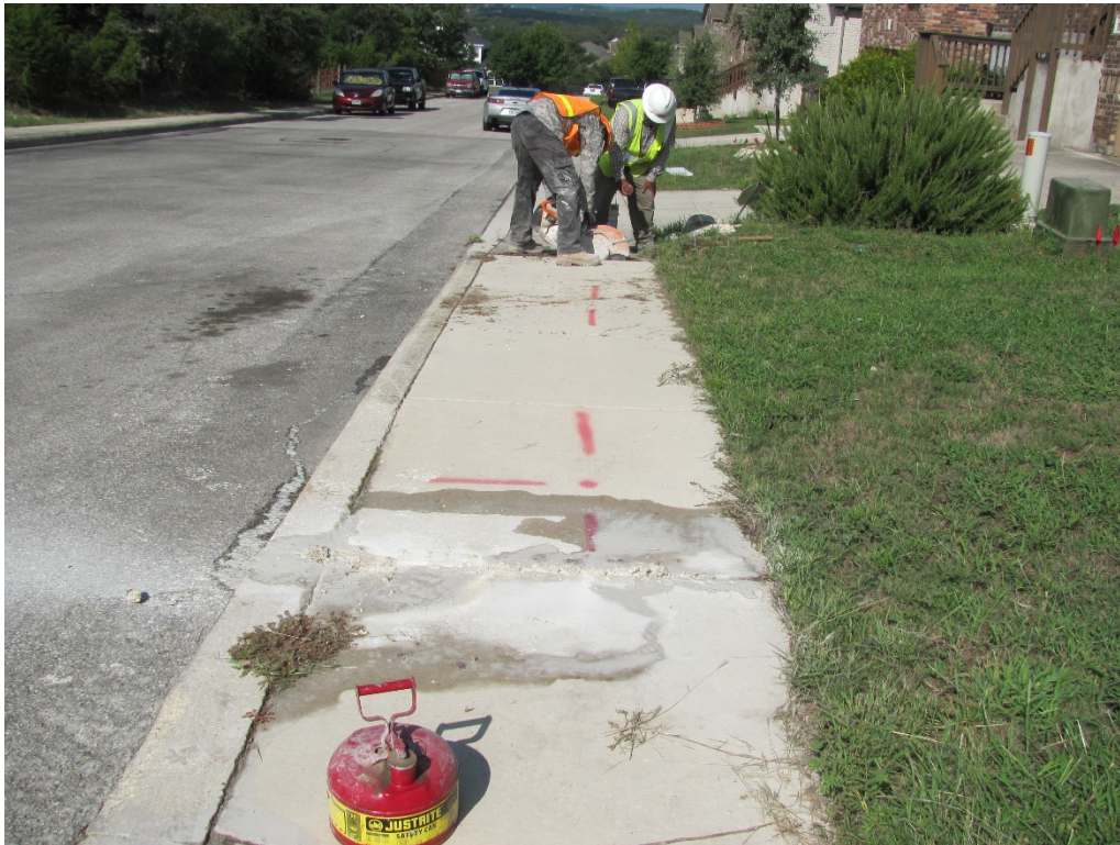
EXHIBIT 6 – PRESIDIO HAVEN WATER UTILITY WORK START 09.14.20