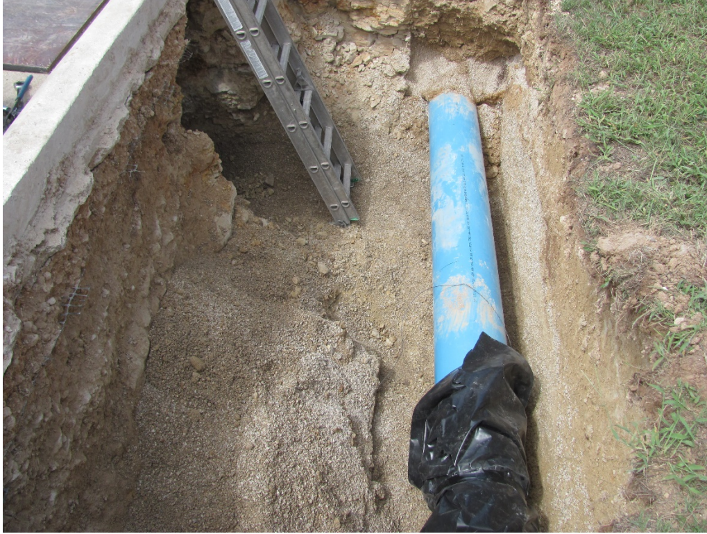
EXHIBIT 11 – PRESIDIO HAVEN WATER UTILITY WORK 09.16.20