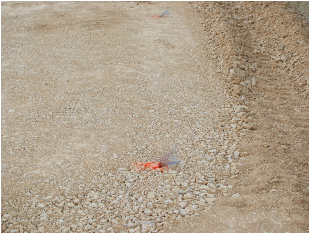
EXHIBIT 12 – SELECT FILL BLUE TOP START 09.17.20