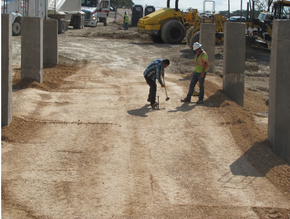
EXHIBIT 5 – SELECT FILL AT APPARATUS BAY; DENSITY TESTING 09.14.20