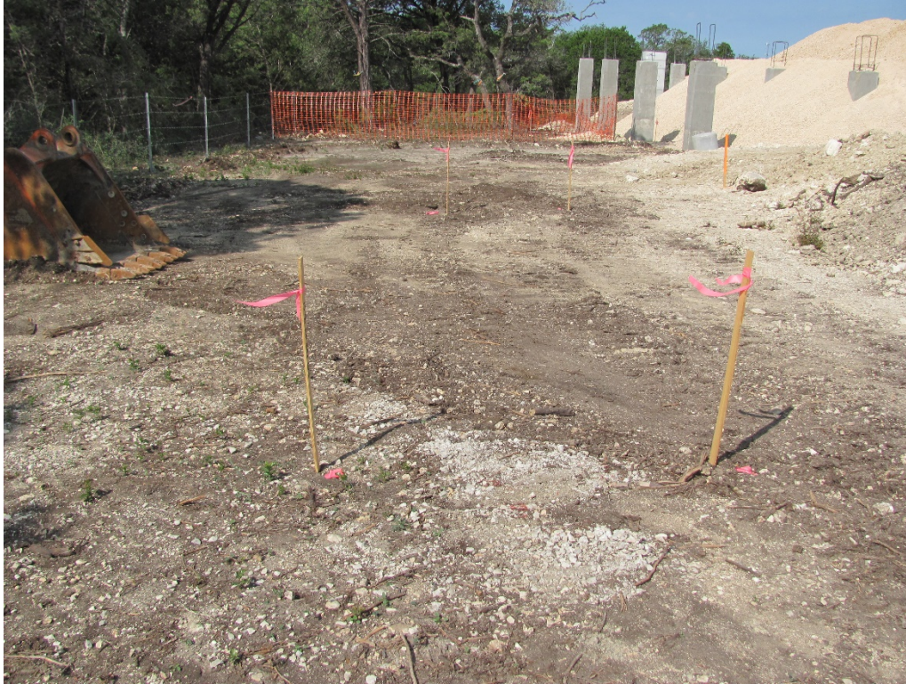
EXHIBIT 15 – RETAINING WALL STAKING ESTABLISHED 09.28.20