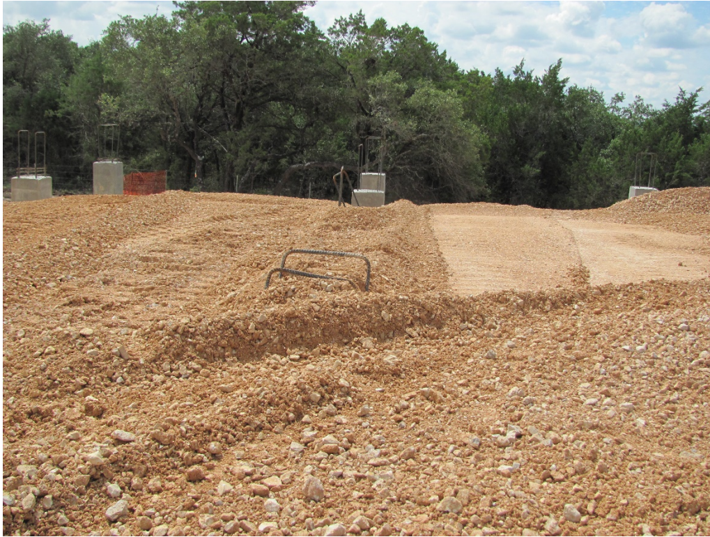
EXHIBIT 9 – SELECT FILL AT APPARATUS BAY 09.16.20