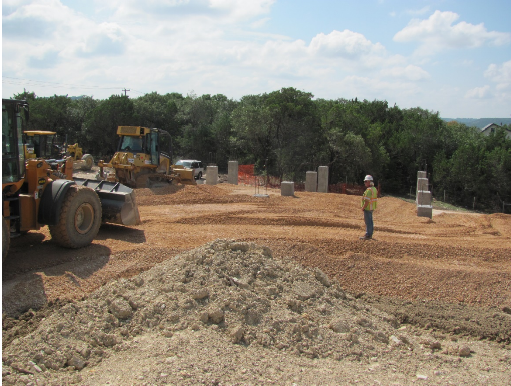
EXHIBIT 7 – SELECT FILL AT APPARATUS BAY 09.15.20