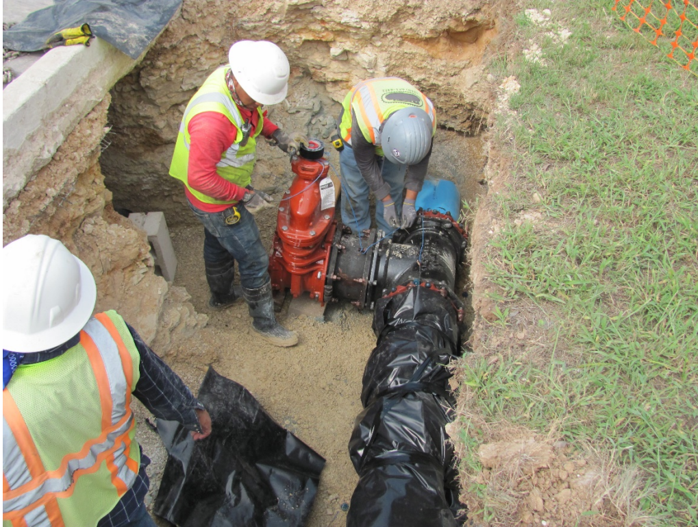
EXHIBIT 13 – PRESIDIO HAVEN WATER UTILITY WORK 09.17.20