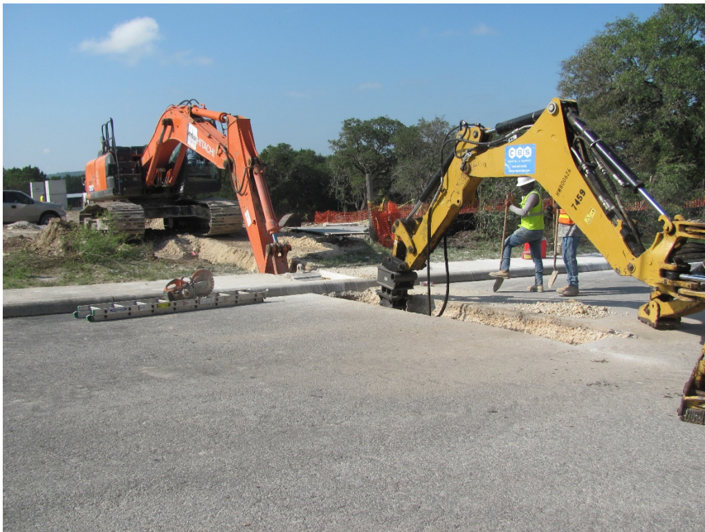
EXHIBIT 8 – PRESIDIO HAVEN WATER UTILITY WORK 09.15.20