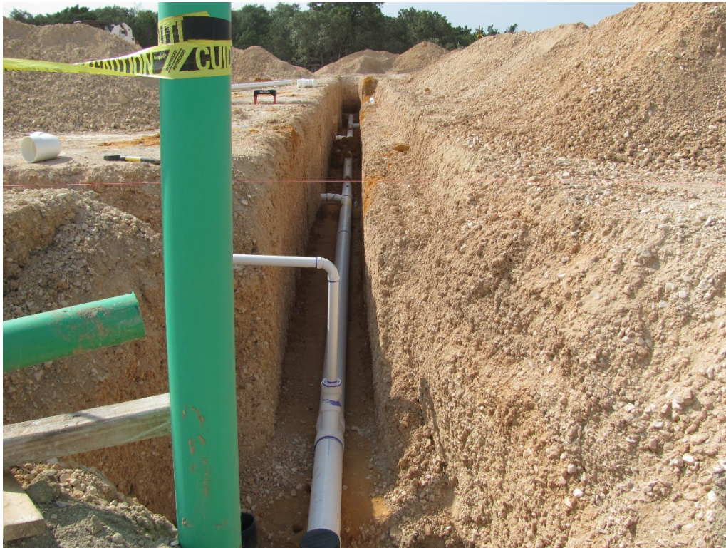
EXHIBIT 14 – PLUMBING INSTALLATION 09.28.20