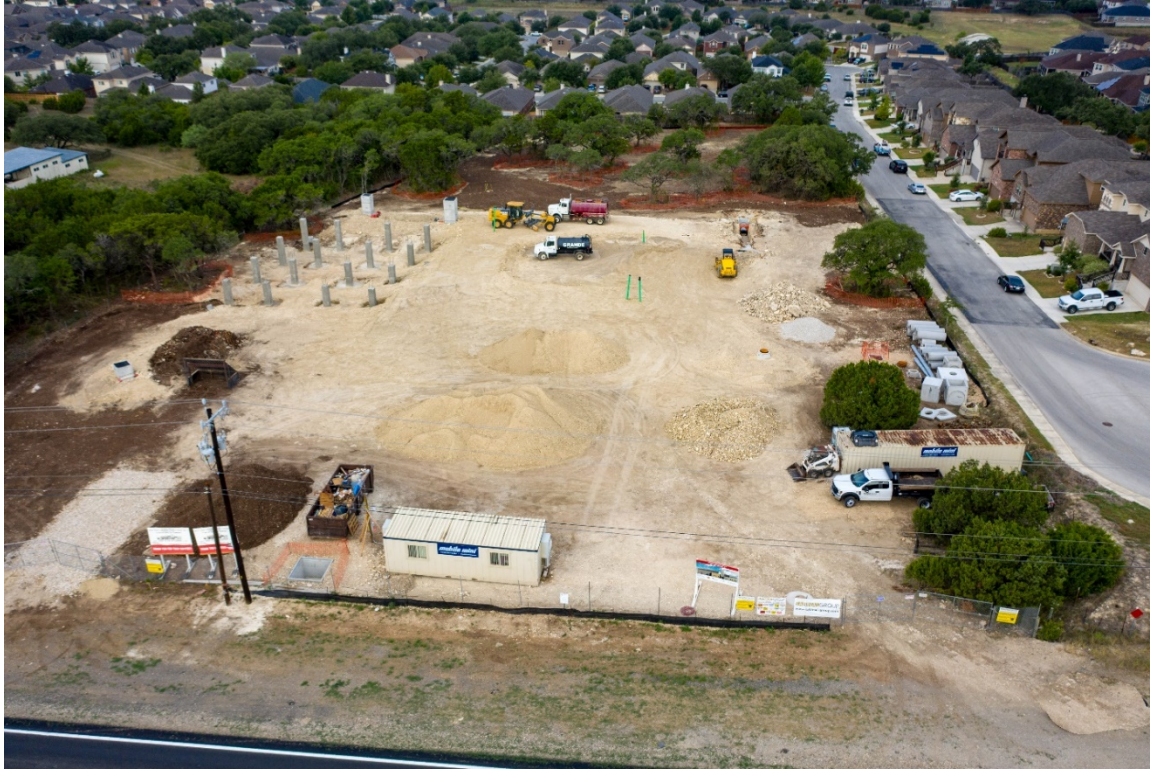
EXHIBIT 1 – AERIAL PHOTO FROM 08.29.20