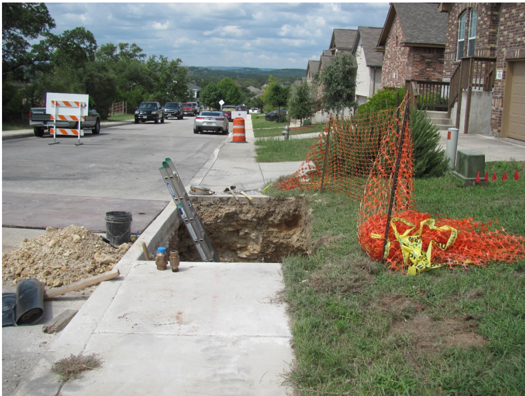
EXHIBIT 10 – PRESIDIO HAVEN WATER UTILITY WORK 09.16.20