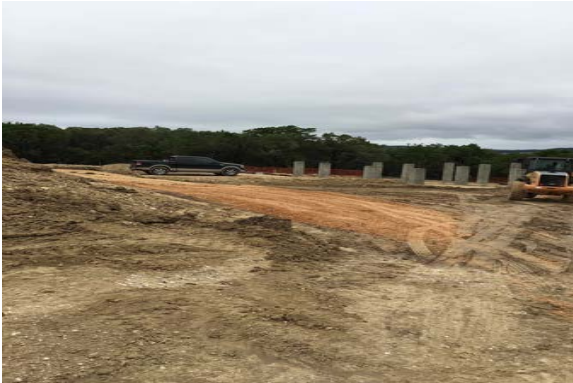
EXHIBIT 2 – SELECT FILL BEGINS ON BUILDING PAD 09.10.20