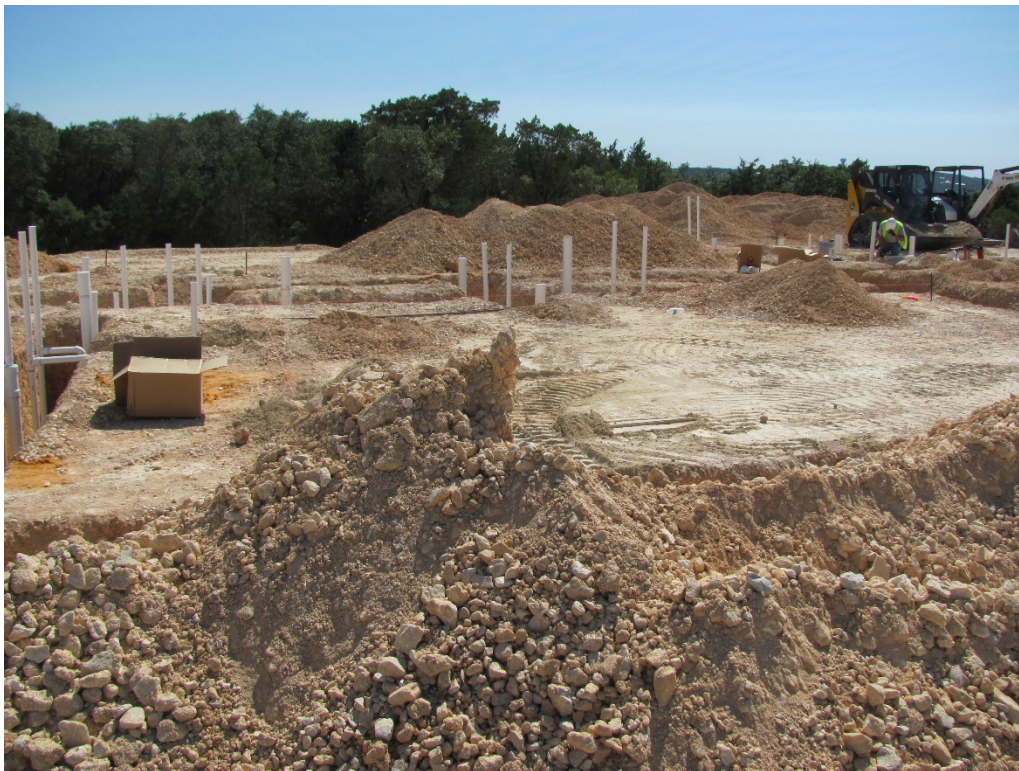
EXHIBIT 16 – PLUMBING INSTALLATION 10.01.20