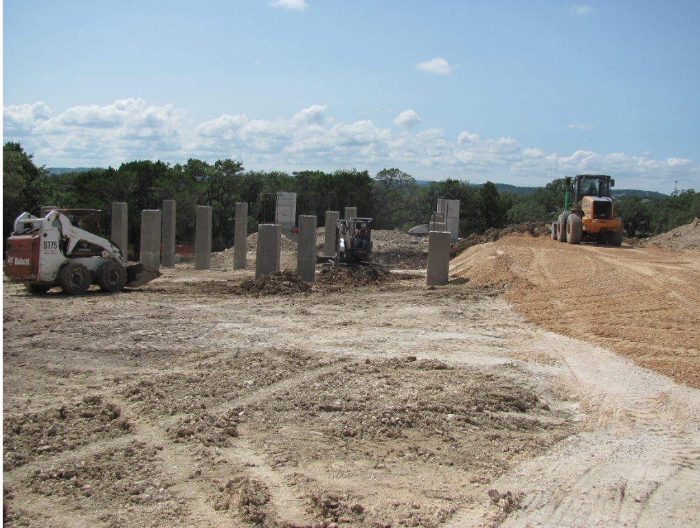
EXHIBIT 3 – SELECT FILL ACTIVITY 09.11.20