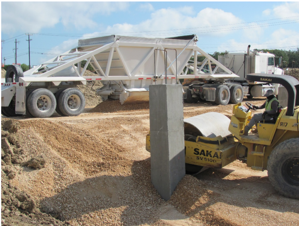
EXHIBIT 4 – SELECT FILL AT APPARATUS BAY 09.14.20