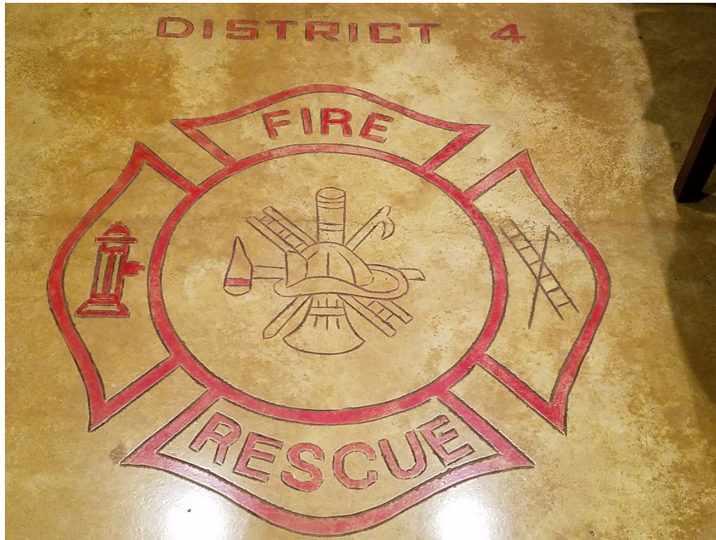
EXHIBIT 17 – ESD 4 LOGO