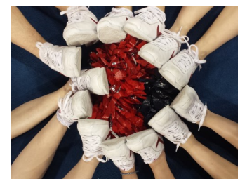
Be a part of TeamOGI's Competitive Cheer Team!

facility in combination with a fun and challenging curriculum that will help you improve all aspects of cheerleading. Our recreational classes work on tumbling, jumps, motions and stunting while keeping you in great shape all summer long. If you are interested in taking your skills to the next level, stop by the front desk to learn about how you can join our competitive cheerleading team here at OGI!