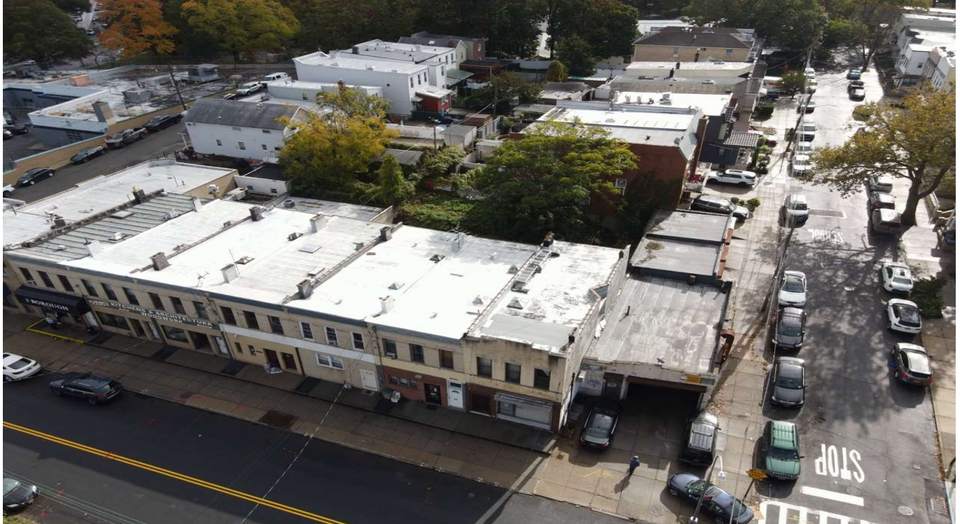
Corner front view