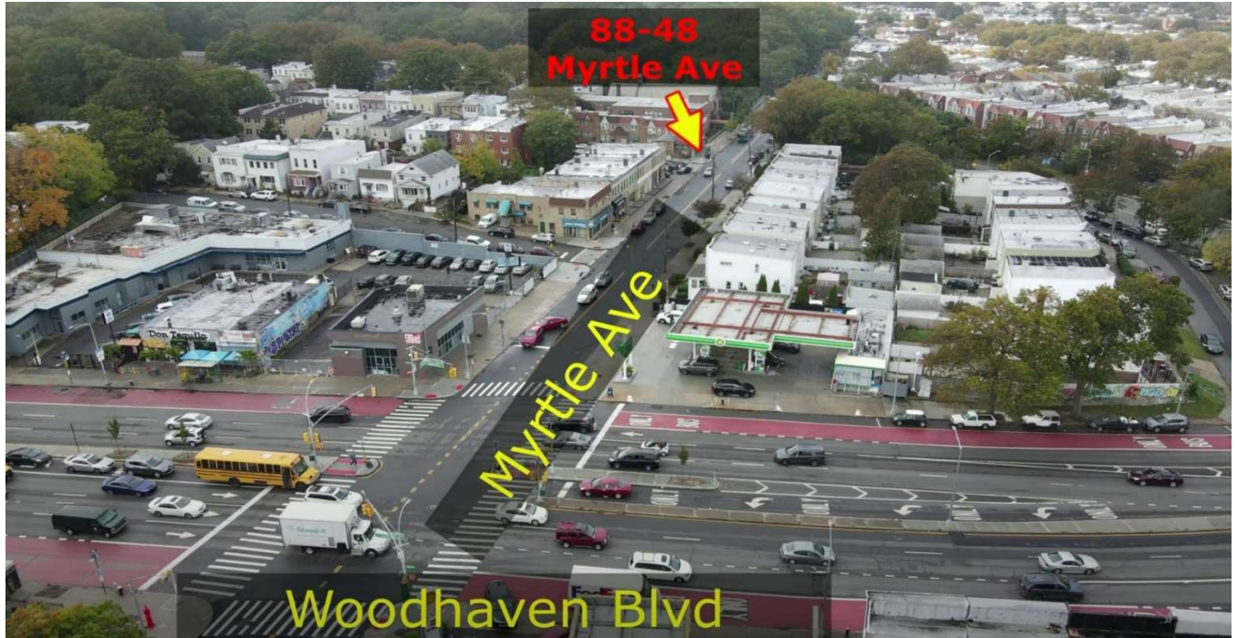
Front of Property: Aerial North to South View