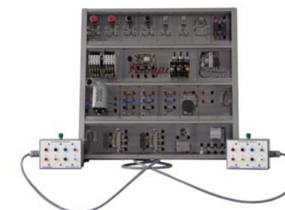
MODEL EM-ACC-100K-MCS shown with Extension Modules

The MODEL ACC-100 Fractional HP AC Controller with faults, includes control buttons, forward-reverse contactor, variable resistors, wound rotor control, DC field contactor, overload relay, rectifier, autotransformer, time delay relays, and 3-pole isolated circuit breaker.