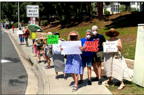
San Diego California