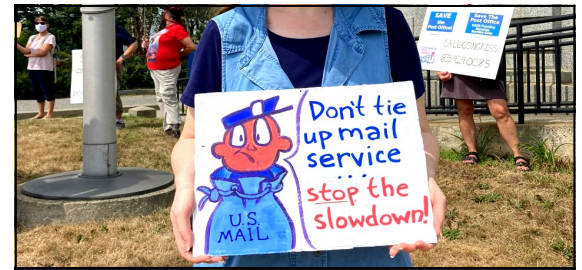
Bar Harbor Maine