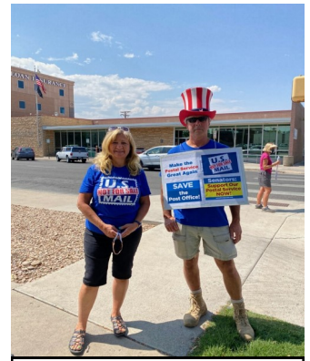
Grand Junction Colorado