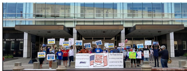
Des Moines Iowa