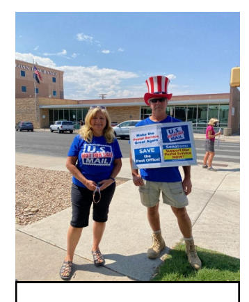
Grand Junction Colorado