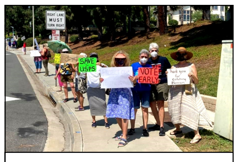
San Diego California