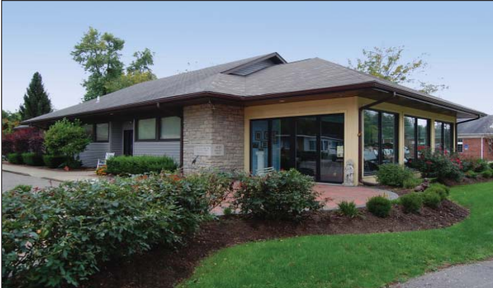
The Buckeye Lake Historical Society Museum opened in 1998 and a front addition was added in 2009 to house the Historic Rocket Ship ride.

The committee will meet for the first time in January of 2013. One event will be a dinner. There will be a ceremony at the Museum to acknowledge our success and a special Queen tour. Ideas are welcome.