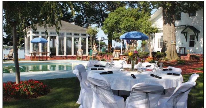
The Splendor of Rownd Island during the Summer Island Tour of 2012