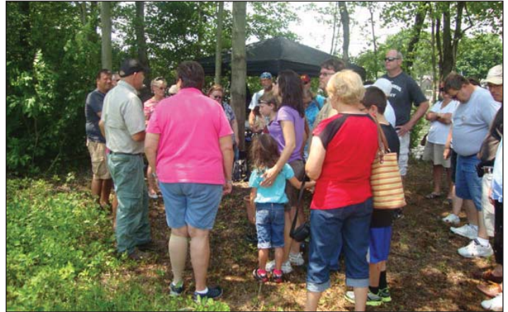
An instructional tour taking place on Bog Day.

The committee is applying for several grants to assist in the monetary issues that plague Cranberry Bog. The committee is also seeking ideas and funding from garden clubs, bird watchers, local businesses, charitable organizations and private donors that have a special connection to this one of a kind floating treasure.