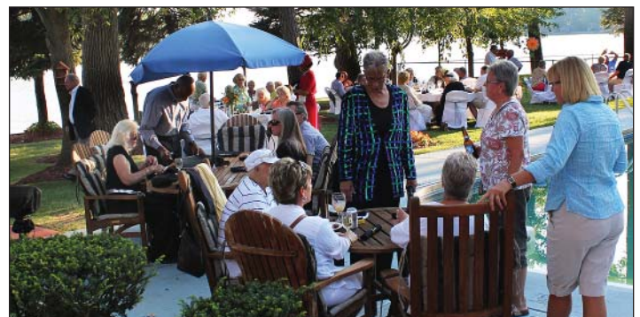
As the band played on, guests enjoyed the pre-dinner cocktail hour during an enchanted evening on Rownd Island.