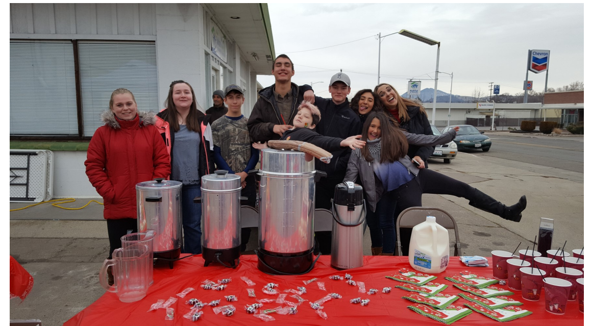
Our Church Family getting ready for Worship.