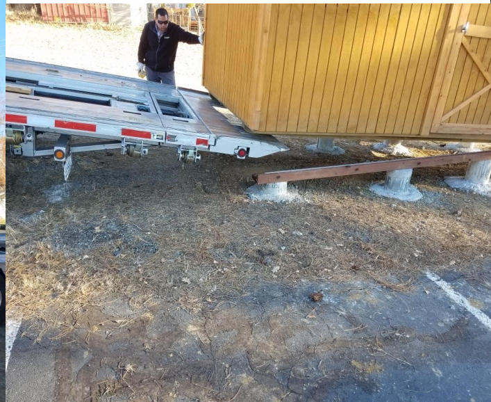
Our New Tailgaters Shed