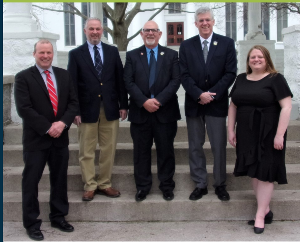
Newark Village Board