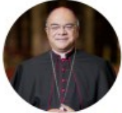
Main celebrant Archbishop Fabre