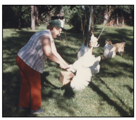
Cutting off the head