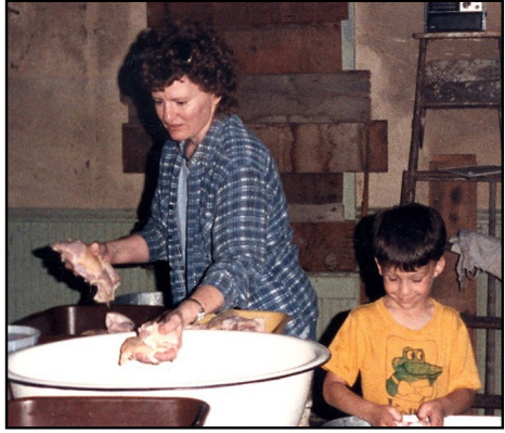
Cut into pieces ready for freezing