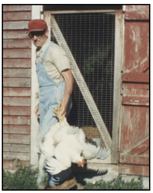
Chickens are caught

plained because the scalded chickens smelled so bad. Then the chickens needed to be washed and all the pin feathers (the very beginning of a feather) removed. Next, it was time to gut the chickens and cut into serving pieces. Finally, they were packaged for freezing. Family, neighbors, and friends would come to help and all would have food for the freezer.