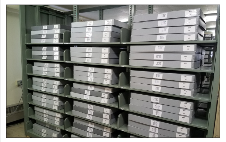
Archives Room: Newspaper Collection The picture above is one row of our newspaper collection, of which we have six. The collection is in our Archives Room, is now stored in archival quality boxes and has been labeled. This allows for easier use and safer storage. We are still missing some newspapers. If you have any prior to 2000 we would love them!