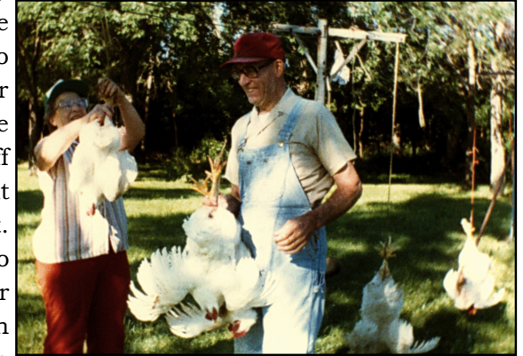
Hanging on the clothesline