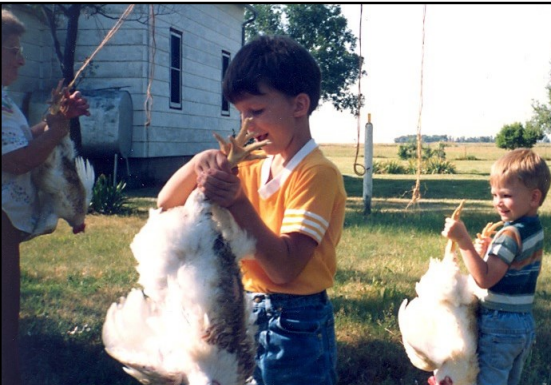
Waiting for Grandma to hang the chickens

We raised broiler chickens for food on the farm. Each spring we would purchase about 100 or 150 baby chicks from the hatchery. The grandchildren loved to hold and play with the baby chicks when they came