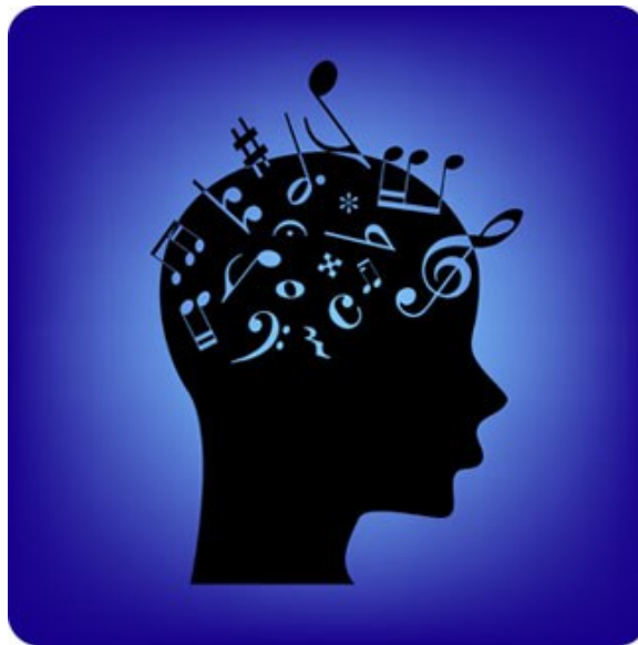
Many things have developed in the minds of men (as music is shown here), but is there a disease that interferes with the functioning of the mind?

Many government programs have been set up for the mentally ill to survive in a world of competition and stigma. Just because some people claim to be mentally ill to get Social Security, does not mean that all mentally ill people do that. In a court room of records you get a sample of the mentally ill, you do not get the reality of it. The reality of it comes