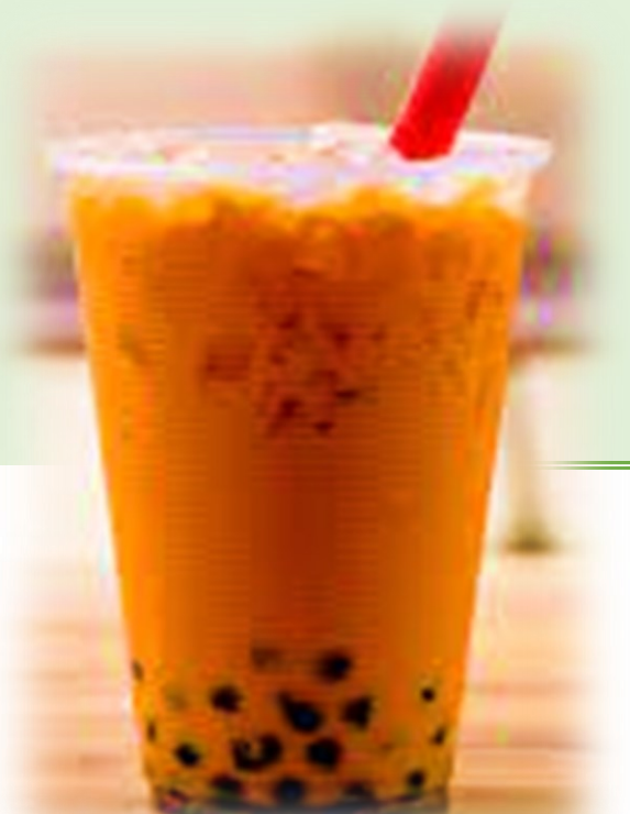
Thai Tea (contains dairy)