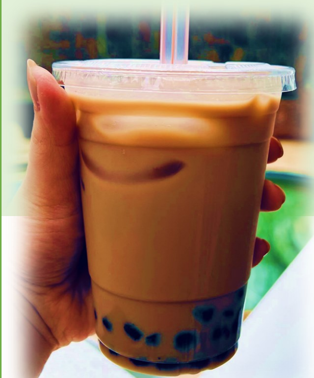
Milk Tea or Bubble Tea (non dairy)