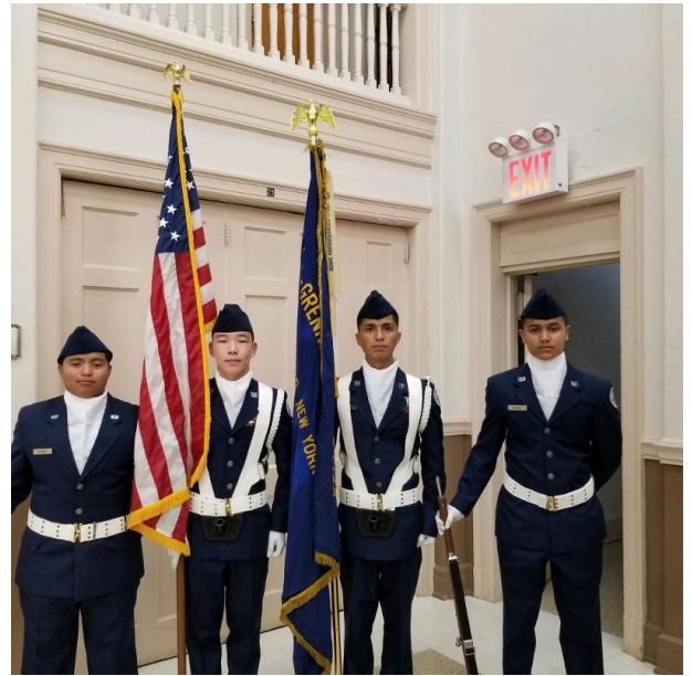
The New Dorp Air Force ROTC

I would also like to thank so many others that helped me in the process.