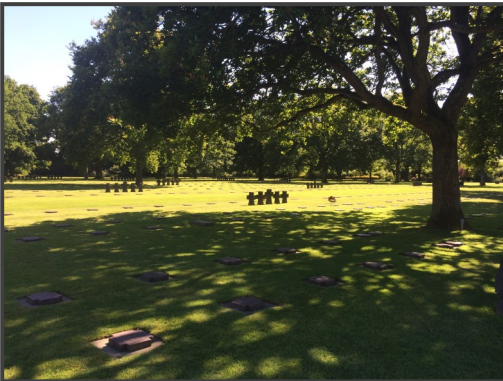
La Cambe German Cemetery (left)