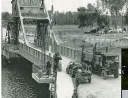
Honfleur: (left) and Pegasus Bridge (right) on way to Bayeux