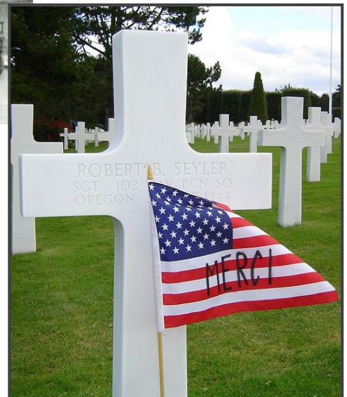
American Cemetery Omaha Beach (right)