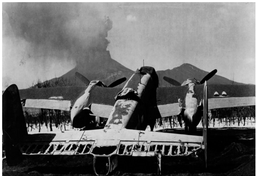
A battered North American B-25 of the 310th Bomb Group rests useless on the dispersal strip under Mt. Vesuvius after the eruption on 23 March 1944.

For details go to: https://www.earthmagazine.org/article/benchmarks-march-17-1944-most-recent-eruption-mount-vesuvius/