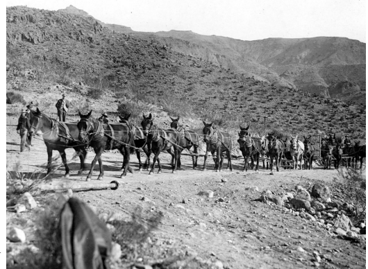
22 MULE TEAM HAULING SUPPLIES TO MINES (PHOTO: EXAMPLE ONLY; NOT IN SIGNAL) MMHS #5279

Had the silver content of the mines around Signal not played out there is a possibility that this area of Mohave County would have been known as "the town too tough to die" instead of that little town in Cochise County known as Tombstone.