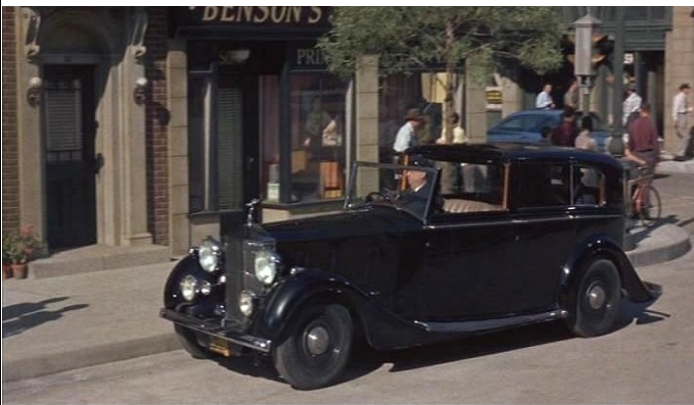
GEORGE HAMILTON'S 1938 ROLLS ROYCE

Kingman finally made world newspapers, radio and television coverage, and it was a Rolls Royce limousine rolling in on US Highway 66 that caused all the commotion. It was one leased by actor George Hamilton and driven by his male secretary from the Hollywood area to Washington, D.C. The Rolls was found by a Kingman policeman when it was left parked behind Denny's Restaurant, an all-night café. The leasing company sent a professional driver Tuesday to pick up the car, a gold one valued at about $27,500.