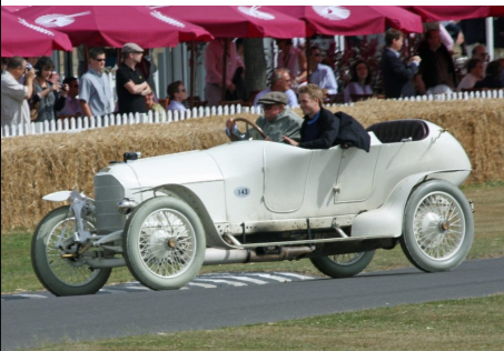
1910 AUSTRO-DAIMLER "PRINCE HENRY"