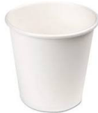
Paper cups (No plastic lining)