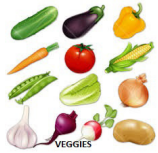
Fruit & Veggies