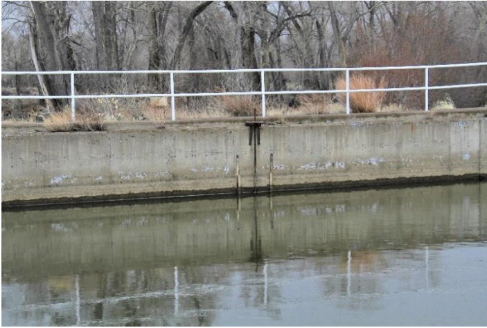
Headgate looking downstream