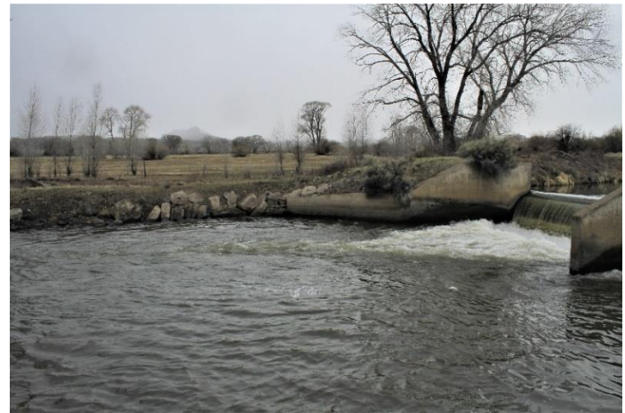
Diversion dam outlet