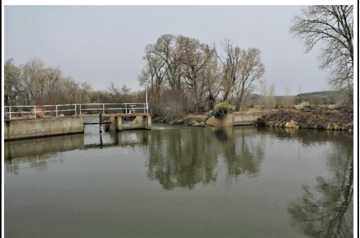
Diversion dam and overflow gate