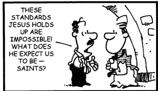
7TH SUNDAY IN ORDINARY TIME